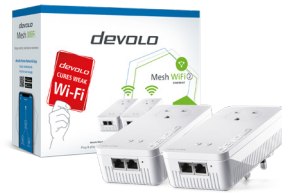
devolo Mesh WiFi 2 Starter Kit 08756 (UK)