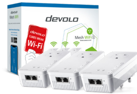
devolo Mesh WiFi 2 Whole Home Kit 08761 (UK)